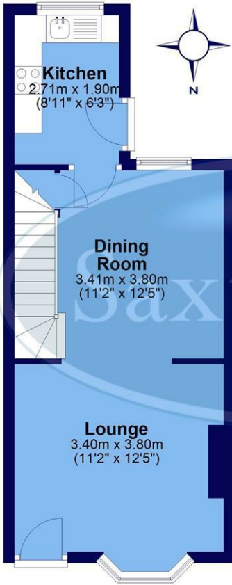
Ground Floor Approx. 31.7 sq. metres (341.7 sq. feet)